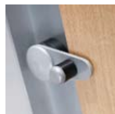
Robust 'Single Action' Latch